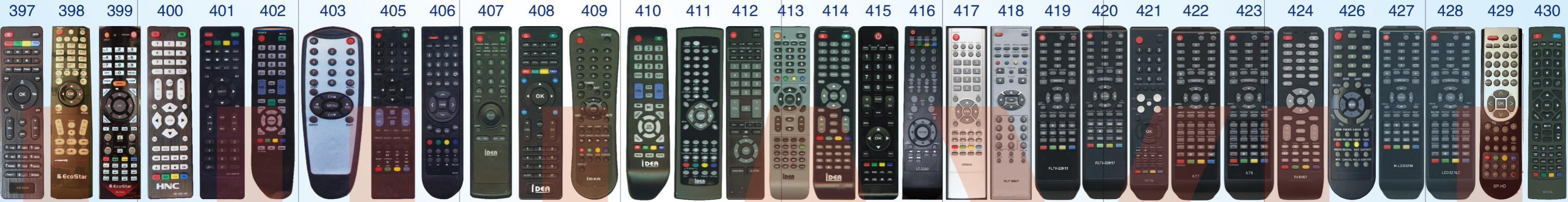
397 HOB688 ATLS HD-200S 398 KK-Y331J 399 KK-Y331J 400 HD LED100 401 GBTV ONGOV59 402 XY-B02E 403 LCD TV PHONAR 405 PHONAR LED TV 406 DAWA MV 407 IDEA 408 IDEA 409 IDEA 410 IDEA 411 IDEA 412 IDEA 413 IDEA 414 IDEA 415 AOC-02 416 DEX LT-2220 417 ORION LED2643 418 Akai SLP-006P 419 Fusion FLT V 22H11 420 Fusion FLT V 32H17 421 FUSION RC15b 422 Shivaki K77 423 Shivaki K78 424 Supra TV-DVD 426 RC-GK22G1 427 H-LCD3210 428 LED321LC 429 SKYPRIME HD SP-HD 430 SUPRA RC21b-1219