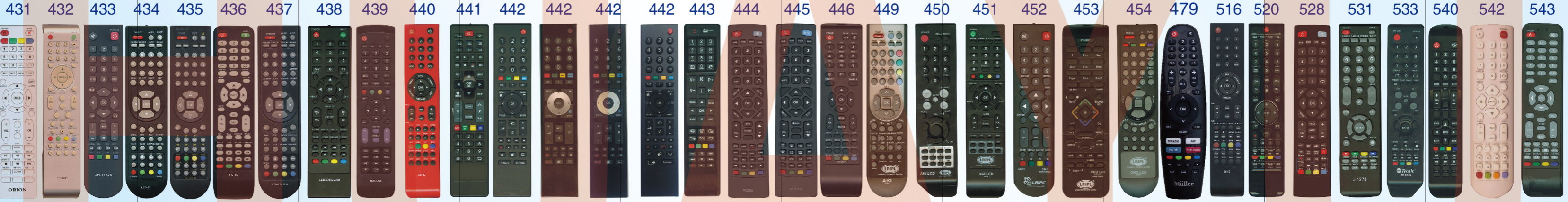
431 ORION LCD TC1860F1-RS 432 JH-11370 433 LED-851 434 RC-D3 435 YC-53 436 STV-22LED5 437 LED-DH720BF 438 DNS M28AM8 439 051D RED 440 33585 441 RC33729 442 HOB842 442 34090 442 34091 443 RC31277 444 Fusion RC25b 445 RCF23b 446 RC-E23 449 AKI AK61 450 AKI LCD AK66 451 AKI LCD AK68 452 AKI-OND IGO LCD 453 ONIDA LCD 454 ONIDA LCD ON87 479 Muller RC1818 IR-V1 516 051D BLACK 520 SNOWA 51163 528 BLAUPUNKT J-1274 531 RM-SK09 533 MERTER 33186 540 BRAVIS LED-1615 542 Marshal ME-2409 543