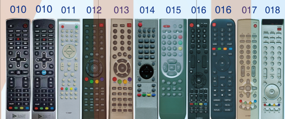
RC-SMART, RC-SMART, HOB117, HOB187, HOB279, 4-3-2010-002, BBK BBK, EN-31603B, Hisense EN2W30H, HOB158, HOB332, AKIRA TC1860F1, GK23J6-C15, AKIRA LCHT-15CHST, BBK CAMERON