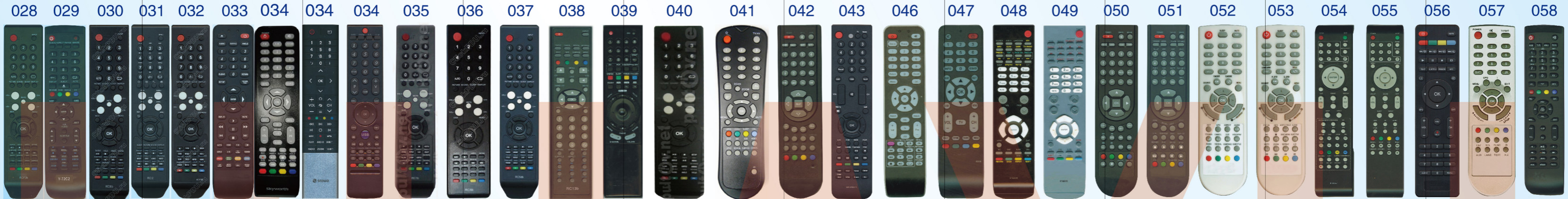
028 HOB328 Supra RCF3b 029 HOB409 SUPRA Y-72C2 030 HOB410 SUPRA RC6b 031 HOB411 SUPRA RC12 032 RCF1B RCF1B 033 SUPRA BD-212 034 SKYWORTH 034 SNOWA HOF22A265GPD9 034 SUPRA HOF12H126 GPD11 035 SUPRA RC1b 036 SUPRA RC5b 037 SUPRA RC5db 038 SUPRA RC13b 039 SUPRA RC-118-0B 040 SUPRA STV-LC2615ED 041 HOB168 SHIVAKI BT0451C 042 HOB231 SHIVAKI 02 043 ROLSEN ER-31607R 046 HTC056 RC1994907-01 047 HTC058 RC198 048 HOB333 81E829 049 HOB394 81E503 050 HOB227 ORION 051 HOB252 OPENBOX -1253 052 HOB281 MYSTERY 5195 053 HOB282 MYSTERY 8151 054 HOB301 MYSTERY KT6957 6857 055 HOB326 MTV-1914LW 056 MESTERY LOD LED TV NEW 057 HSR499 HIVION 058 HOB402 ISTAR