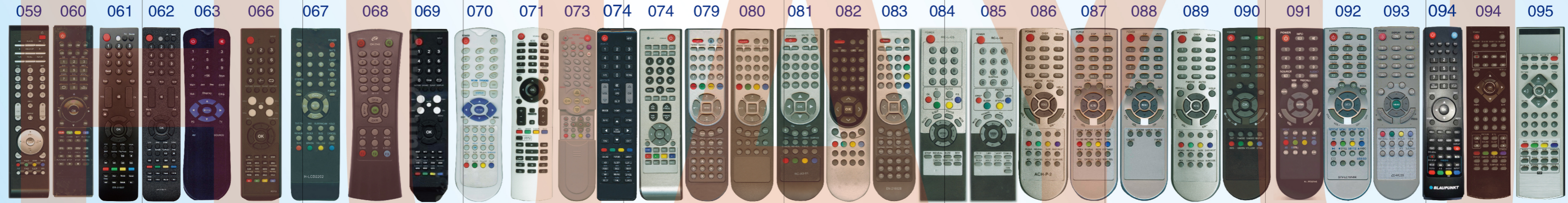
059 HOB403 ISTAR 060 HOB405 ISTAR 061 ER-31607 062 HOB438 ER-31607R -1098# 063 LCD-2277RC 066 HOB302 HYUNDAI 1587 RCF1B 067 HOB376 H-LCD2202GCO VA1028SJ 068 HOB390 CH-2145 069 FUSION RC3_1042 070 FUNAI 48KEY 071 IR1628 FUNAI PC221 073 HOB018 ELENBERG Y27401 074 X-VISION RC29025 074 ELENBERG 079 HOB151 BERICOM008 080 HOB189 HOB189 081 HOB264 RC-A3-01 082 HOB273 HOB273 083 HOB373 EN-21662B 084 HOB223 RC-L-05 085 HOB225 RC-L-06 086 HOB108 ACH-P-2 087 HOB149 BERICOM006 088 HOB150 BERICOM007 089 HOB206 EL-41UA299 090 HOB329 T15E01MT 091 HOB330 H-LED32V6 092 HOB341 STV-LC1914W 093 HOB418 ZD-RC30 094 BLAUPUNKT 094 DMTECH DMTECH 095 HOB262 HOB262