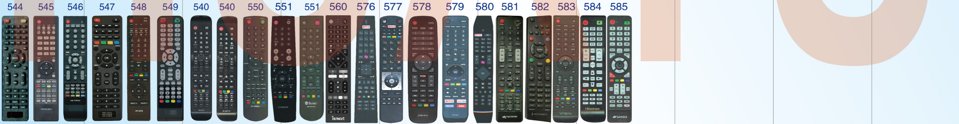
544 ONIDA LCD1 545 Akai HOF08J001 546 Polar 94 LTV6004 547 AN-LT3222 AN-LT3225 AN-LT2416 548 FUSION HY-079 549 SATURN LED40FHD500U 540 DEXP 16A3000 540 RUBIN RB -28D7T2C 550 DNS S19ASL1 551 XVISION 06-53WV39-XV02X 551 RM-NST60 560 iSmart ATV 576 VESTEL LCD T1396 577 VESTEL LCD 578 HAIER HTR-A10 579 EN3V39H 580 VESTEL LCD T1560 581 MICROMAX 582 RECONNECT 583 YASIN 584 HISENSE 585 SANSUI