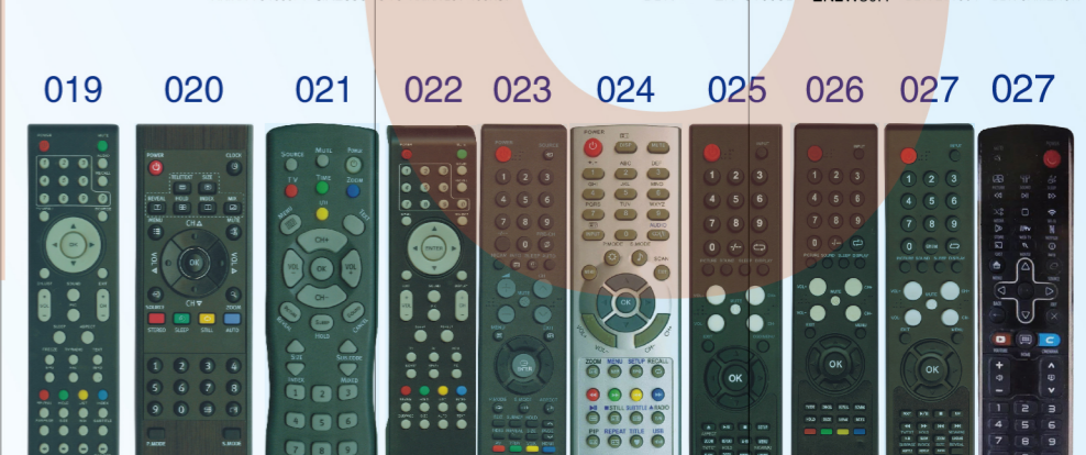
HOB380 RC2465, HOB387 RC-2603, HVD208 BBK, HVD209 RC1529, HOB228 LCD 831, HOB283 SUPRA 4627STV-LC1504, HOB302 HYUNDAI 1587 RCF18, HOB303 SUPRA306 1587 RCF18, HOB327 Supra RC3b, SAMASUNG HOB332 RC1667-01