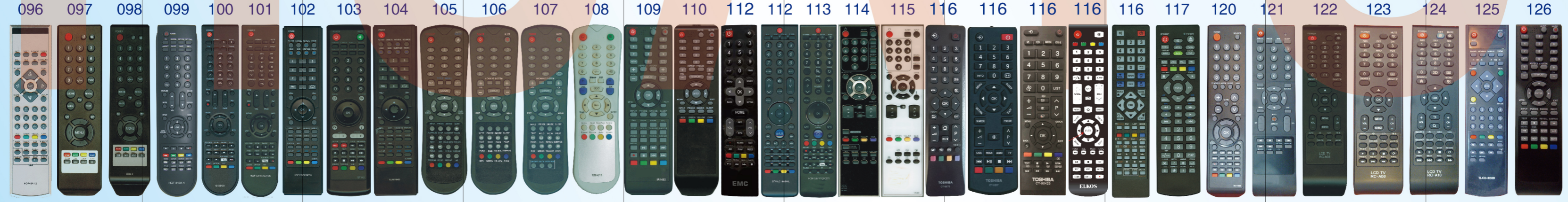
096 HOB344 HOF45A1-2 097 HOB249 PARS 098 HOB292 H502-2 099 HOB013 HOF-54B1.4 100 HOB339 GI S2138 101 HOB381 HOF12E 148GPD5 102 HOB346 HOF10G 705GPD9 103 SONIQ QT-112 104 SUNSTECH TL1970HD 105 HOB195 H-LCDVD2200 106 HOB196 HOB196 107 HOB314 Singer LCDKZG -108 108 HOB386 RM-611 109 HOB308 IR1492 SENCOR 110 HOB310 HOB310 112 EMC RC1359 112 HOB342 STV -LC1985WL 113 HOB382 GI HOF12B44NF028RD-NF031RD 114 HOB220-NF021RD -NF036RD 4IN1 115 NF039RD NF039RD 116 TOSHIBA CT-8070 116 TOSHIBA CT-8507 116 TOSHIBA CT-90423 116 TOSHIBA CT-95022 117 PC221 01 120 PC221 02 120 BC10SB BC10SB 121 daytron LCD TV 122 HOB358 RC-A03 123 RC A06 124 RC A10 125 TLCD 32HD- TELEFUNKEN 126 KAIMY KAIMY