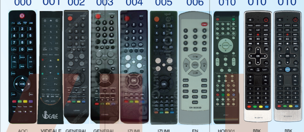
AOC AOC, VIDEALE, GENERAL LCD-831, GENERAL LCD-832, IZUMI TL19H405B, IZUMI 0152, EN 30303D, HOB301 MYSTERY KT6957 6857, BBK RC-LEM110, BBK RC-LEX510