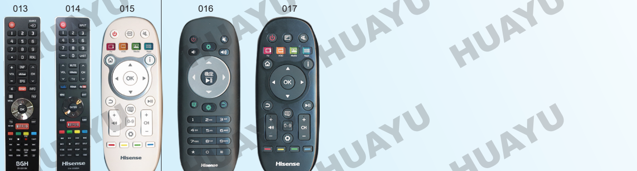
ER-33911BN EN-33926A CN3B16 CN3B12 CN3A26

Thank you for using our company remote controller products. When it is the first time to put in the batteries, please try it first. If it could work well with all of its functions, the product can be used directly without setup. If it could not work well, it should be set with the following methods before controlling your TV. This remote controller would not lose its memory when you change batteries, no need to reset.