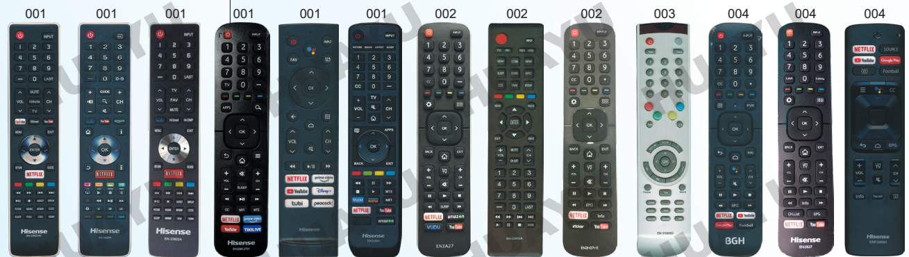
EN-33933HS EN-33927A EN-33922A EN2BK27H ERF3A90 EN3I39H EN2A27 EN-22652A EN2H27HS EN-31906D ERF2M60B EN2B27 ERF3S69H