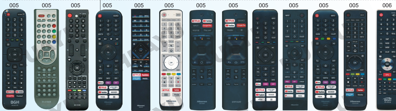
EN2BZ27B EN-21662B EN-31603B EN2N30H EN3A70 EN3AB39H ERF3169H ERF3Q69 FH210705000050Y1 RC1736 EN2J30H EN3AG39H ER-33912B