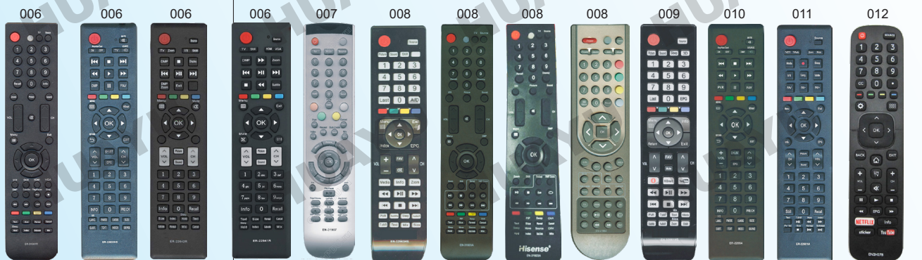
ER-31607R ER-22655HS ER-22642R ER-22641R EN-31907 EN-32963HS EN-31603A EN-31603A EN-21662 ER-32961HS ER-22654 ER-22601A EN2H27B